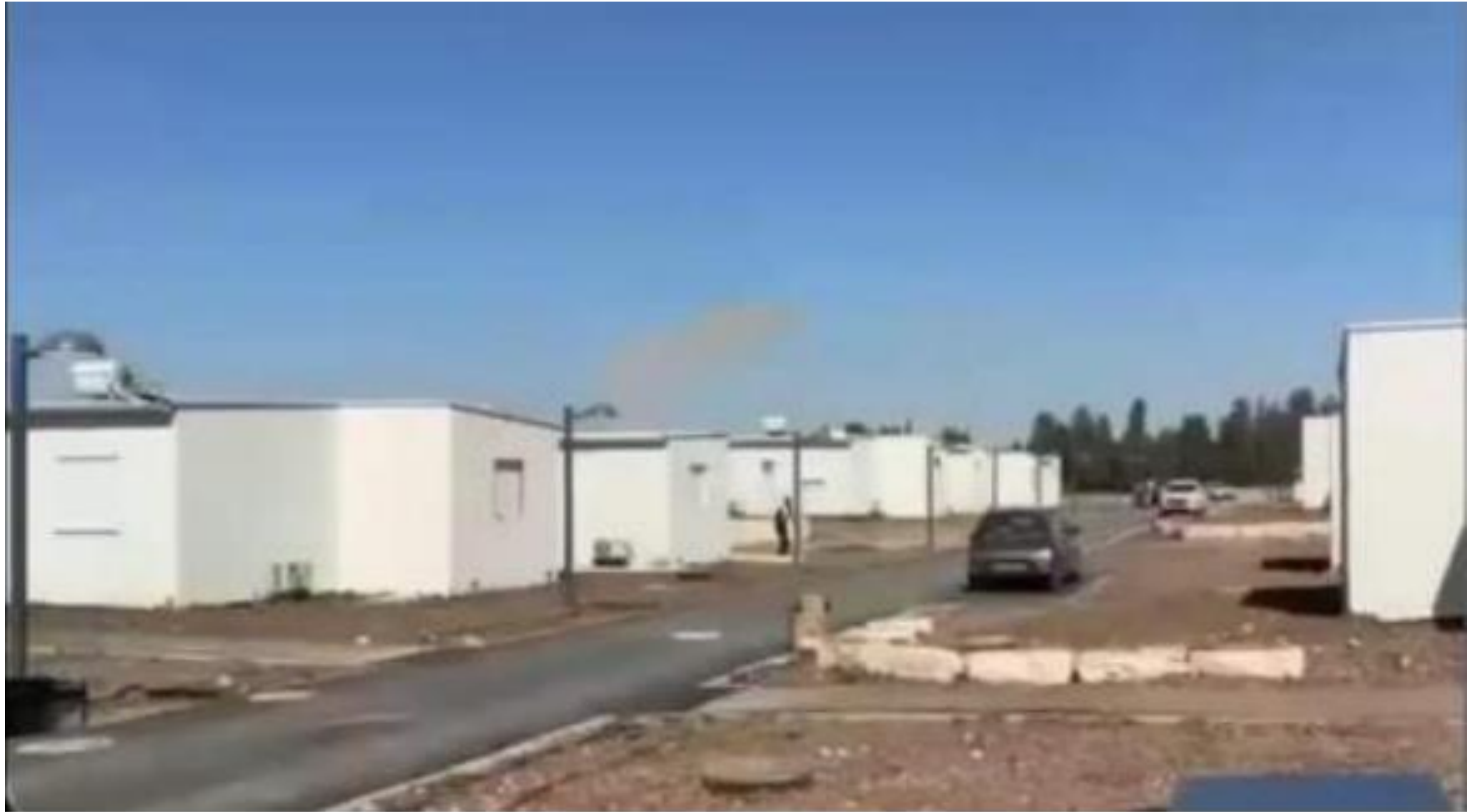
“Karavilot” - A neighborhood of tiny houses on bare ground - February 2023.